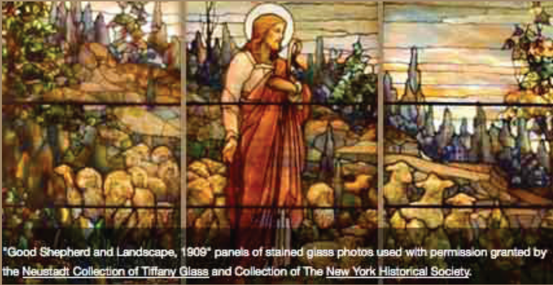
"Good Shepherd and Landscape, 1909" panels of stained glass photos used with permission granted by the Neustadt Collection of Tiffany Glass and Collection of The New York Historical Society.